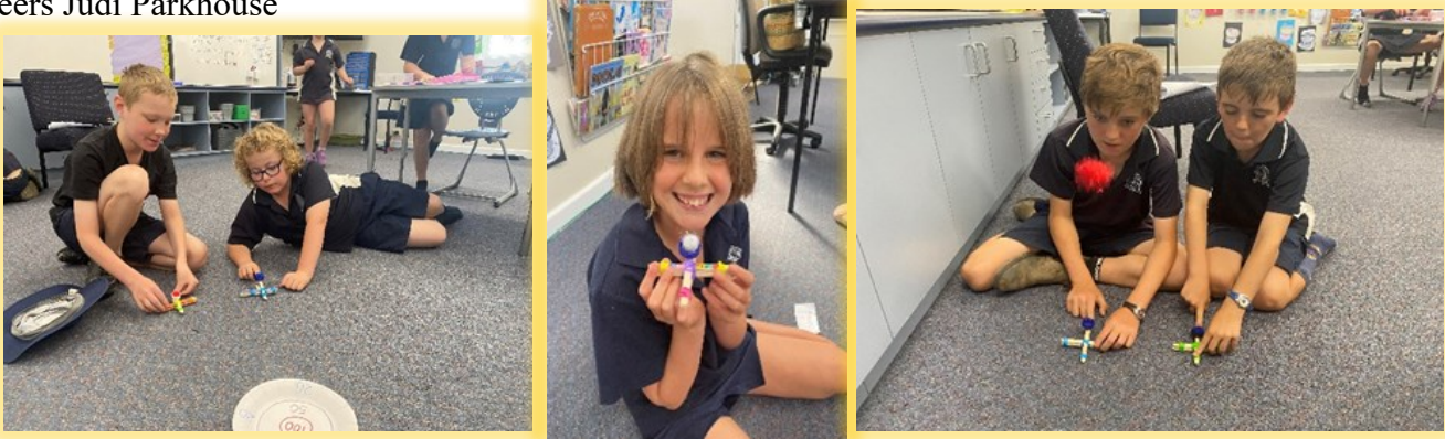
Building a Popsicle Catapult STEM activity - We are learning to understand the force/energy relationship of a catapult.